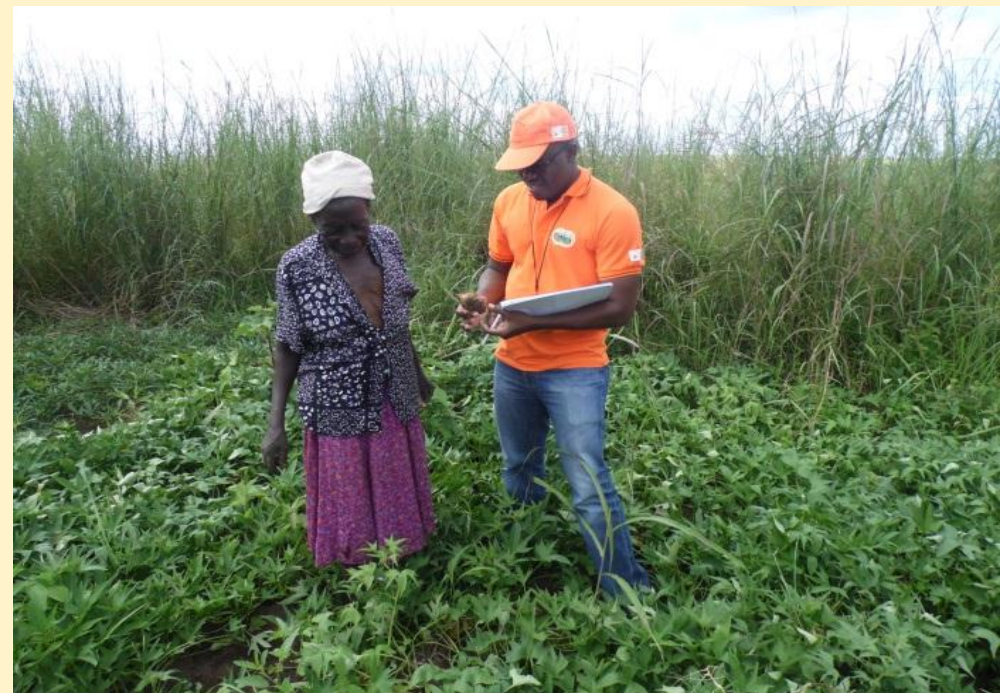
Figure 2. Sweetpotato farmers being interviewed in Namaacha district, Maputo province, during the rapid appraisal conducted in March 2013