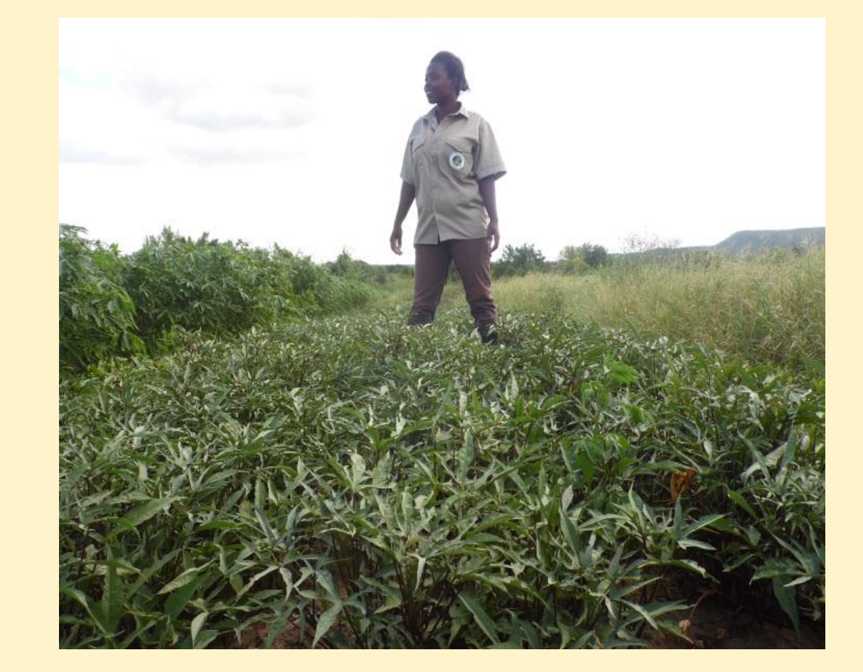
Figure 4. Variety Irene in Moamba district (South of Mozambique) rapid appraisal, March 2013