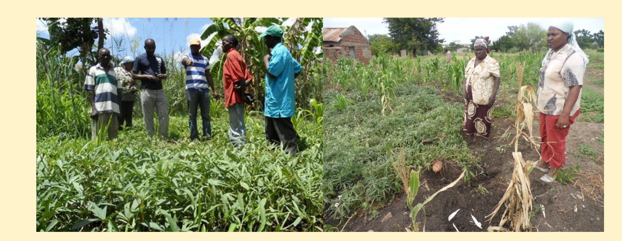
Figure 3. Variety Delvia found in Ile district (North-Central Mozambique), and Moamba district (South of Mozambique) rapid appraisal, December 2012

In terms of dissemination, Delvia (Fig. 3), Irene (Fig. 4), Sumaia (Fig. 5), Namanga, and Bela were the most important. About 53% of the 252 visited farmers planted Delvia, and most of farmers planted and replanted Delvia due to a good adaptation of the variety in both lowland and uplands, on one hand, and also because of the relative good yield and taste. The same situation is valid for the variety Irene, which is very similar to Delvia, but in this case with red stems.