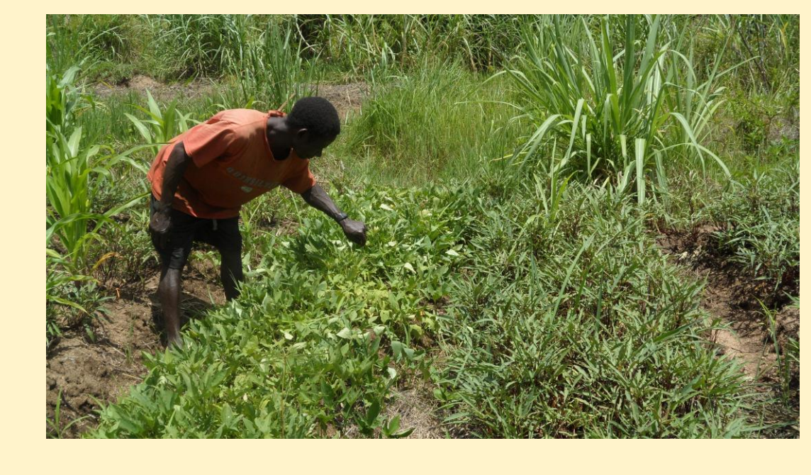
Figure 6. Plot with Irene and local variety in Mocuba, December 2012

One important observation during the rapid appraisal was the tendency to prefer varieties such as Delvia and Irene with morphological distinctive characteristics compared to local varieties (Fig. 6). Farmers can easily distinguish Delvia and Irene due to their long and tiny leaves. However, some varieties with good yields, such as Namanga, Bela, and Ininda, but with upper side very similar to majority of local varieties tend to be discarded, unless the leaves are good for consumption.