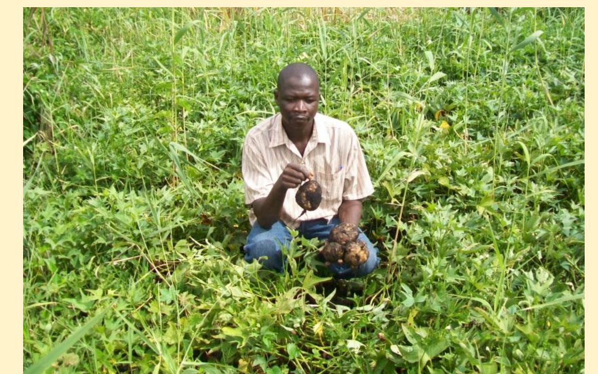
Figure 5. Variety Sumaia in Inharrime district (South of Mozambique) rapid appraisal, March 2013

One important observation during the rapid appraisal was the tendency to prefer varieties such as Delvia and Irene with morphological distinctive characteristics compared to local varieties (Fig. 6). Farmers can easily distinguish Delvia and Irene due to their long and tiny leaves. However, some varieties with good yields, such as Namanga, Bela, and Ininda, but with upper side very similar to majority of local varieties tend to be discarded, unless the leaves are good for consumption.